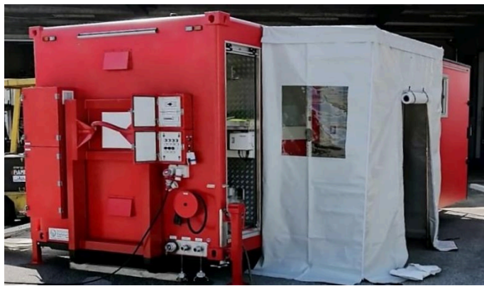
Front view of equipment area and awnings for toilet and changing area