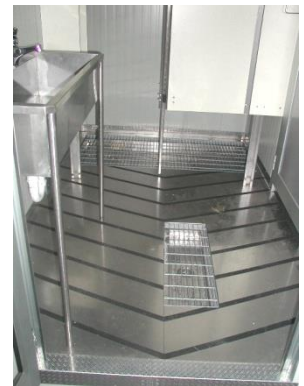
ISO-20Foot-1CC monobloc container equipped with toilets in three areas