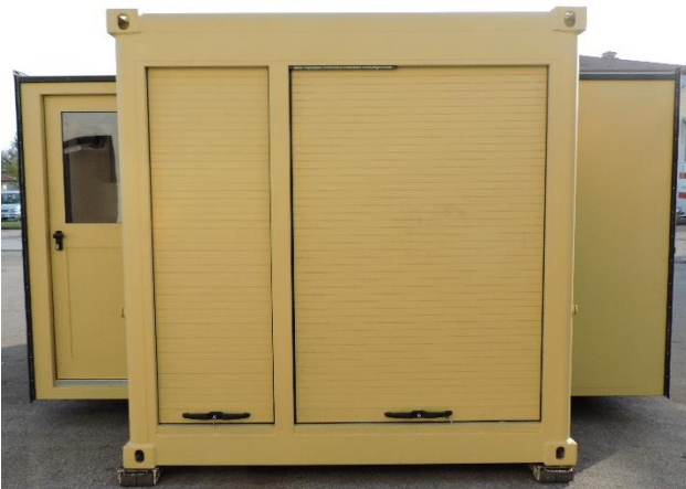
Rear view with the extended symmetric sides and technical compartment