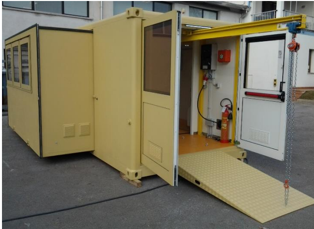
Front view in operating position