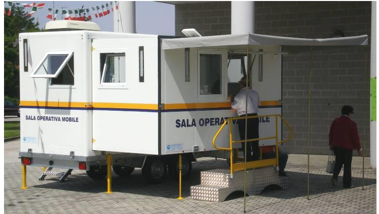
Full view of the user access area, in operating position, on trailer