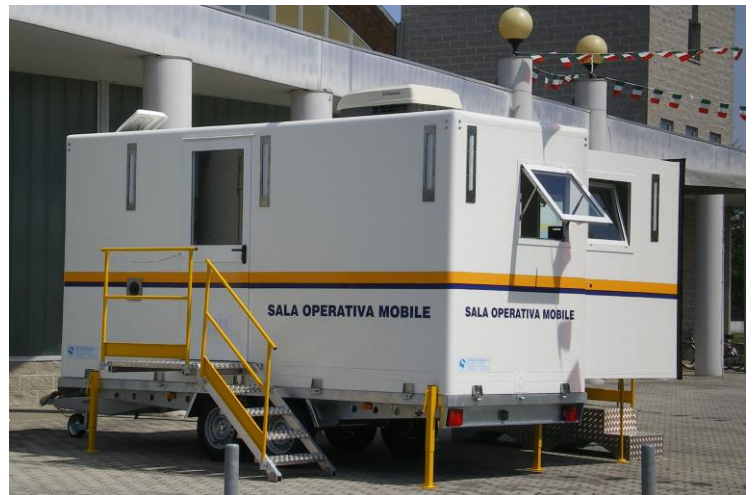
Full view of the worker entrance area, in operating position, on trailer